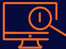
AIO monitor with Intel® Celeron™ processor