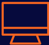
Updated operating system